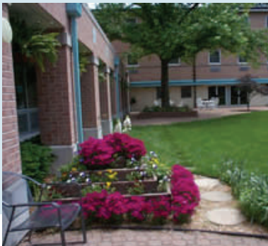
Mercy Center Courtyard