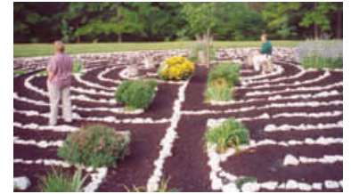
Mercy Center Labyrinth